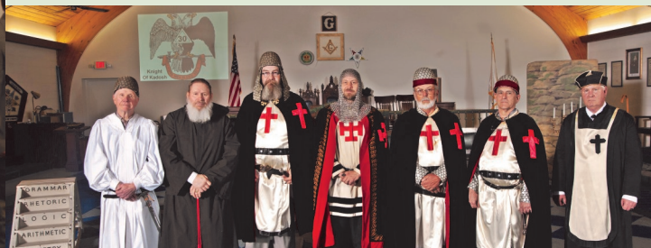
The 30 th Degree Cast from Eureka Springs has continued to provide an excellent degree at our reunions for many years.