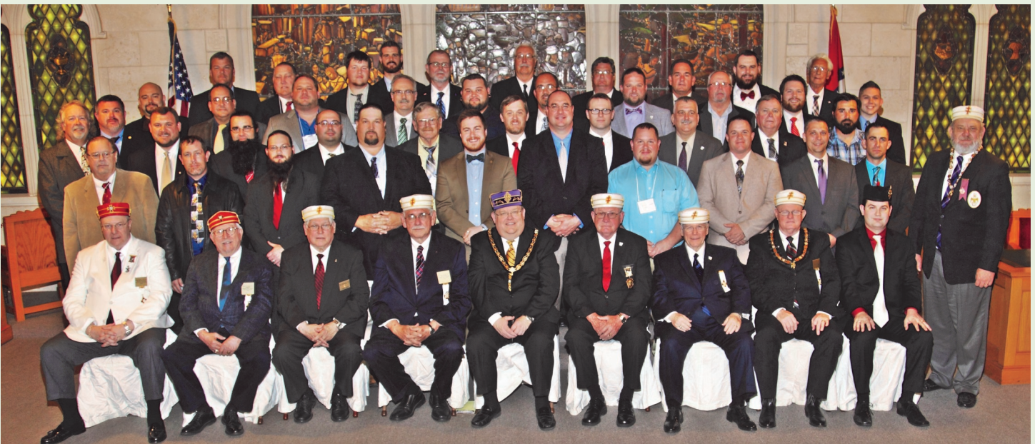
Valley of Little Rock Orient of Arkansas

It is said that a journey of many miles begins with a single step. I believe that we've made many good steps in the right direction so far this year, but we still have a long way to go. The bottom line is that we must grow in Scottish Rite membership in Arkansas if we want to keep our Albert Pike Temple and for the future of the Fraternity. Every single member has a role to play!!! Even if you can't attend meetings or reunions, just the fact that you pay your dues means that you are supporting the future of our Fraternity. And I am thankful for all those who are active in almost all Scottish Rite activities, those who only attend at reunion time, and those who can't attend but maintain their membership! Thank you!!!