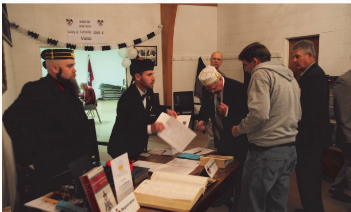
Knights of St. Andrew were busy checking in our candidates and selling Master Craftsman I.